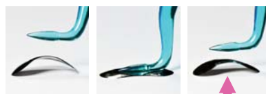
QuickmatFlex sectional matrices